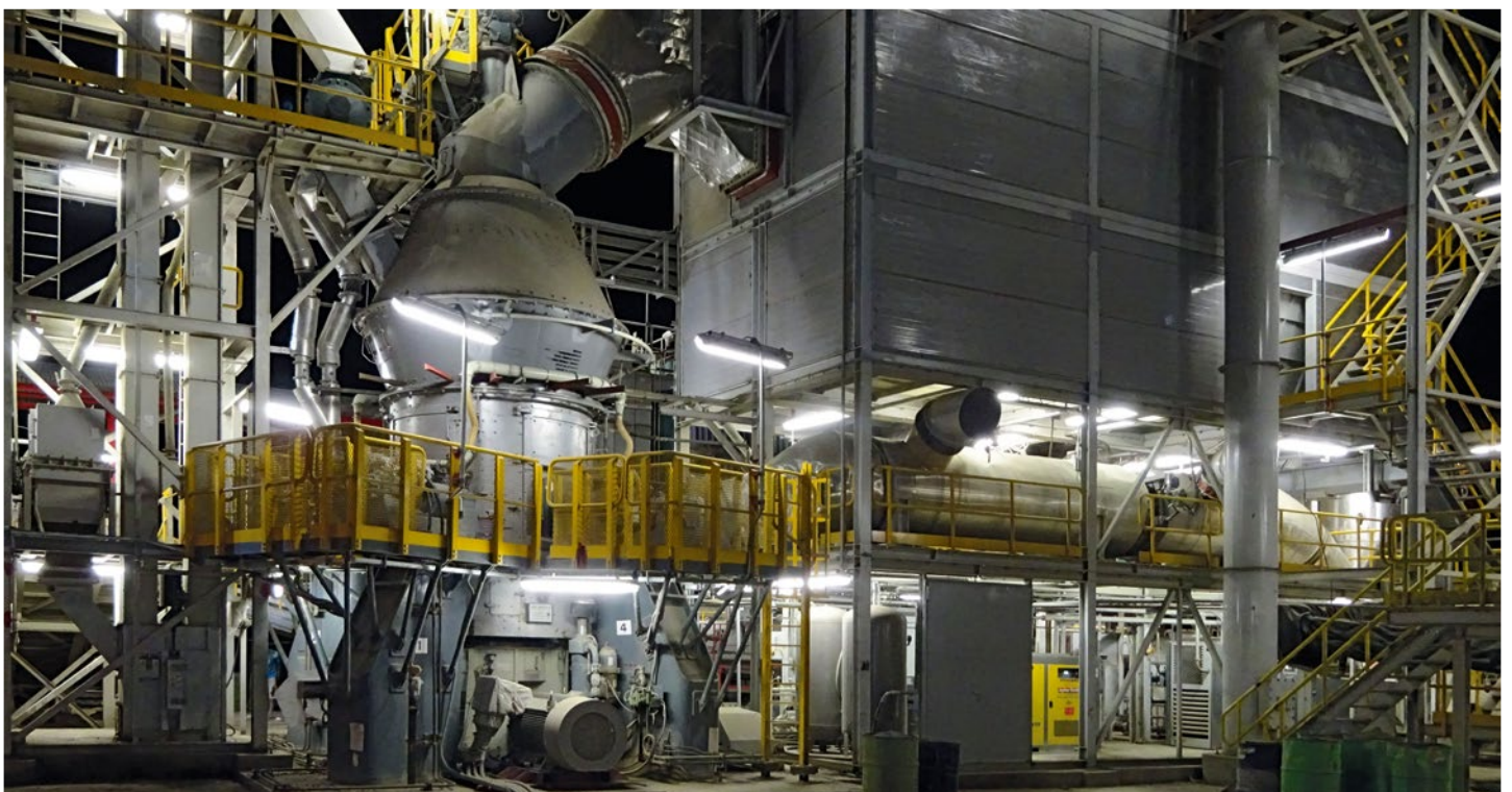
The world's first modular system with a vertical cement mill operating in Africa

Clinker and additives are ground, dried, and classified in the Pfeiffer vertical mill. Product quality and fineness can be set within wide limits (up to 6,000 cm 2 /g Blaine). The ground and dried product is separated from the process gas in a filter for entire dust collection which is followed by a fan. Downstream of the fan, the volume flow is divided: part of it is returned to the mill while the remainder is evacuated through the exhaust gas chimney.