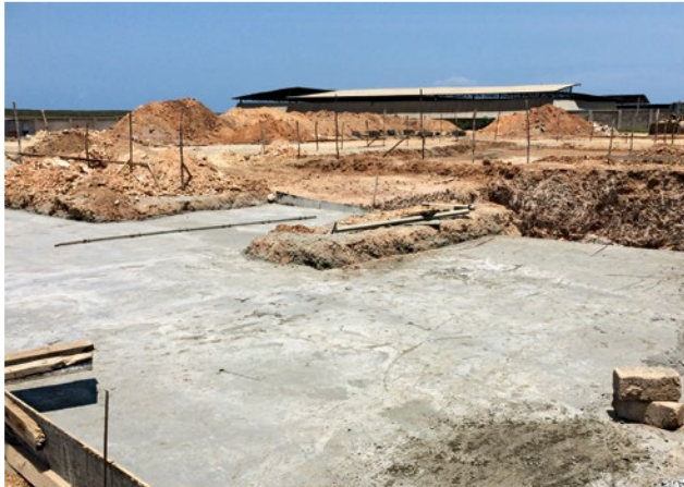
Client has prepared the site