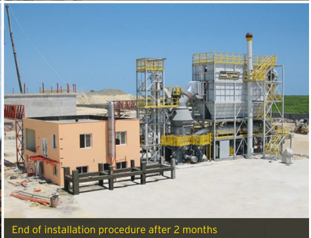
End of installation procedure after 2 months