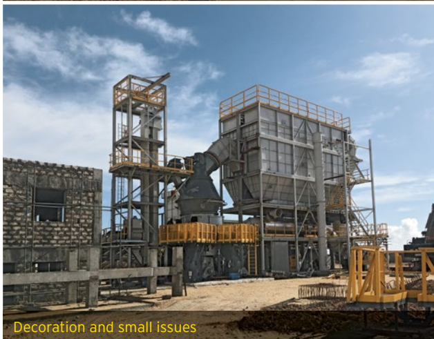
Decoration and small issues